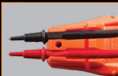
Test-leads seated in the lead holders on the back of the tester are spaced correctly to test tamper-resistant US-style outlets.