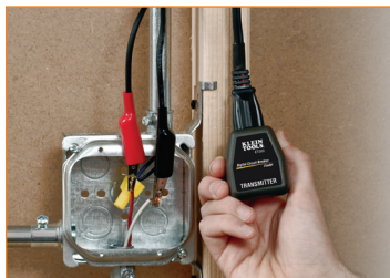
Alligator Clip Adapter for Bare Wires