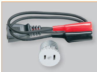
Kit (Adapter and Clips)