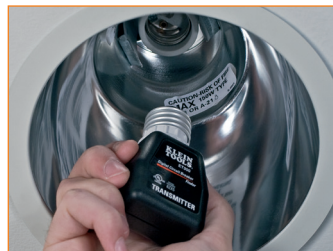
Light Socket Adapter

⚠WARNING: Read, understand, and follow all instructions, cautions and warnings attached to and/or packed with all test and measurement devices before each use.