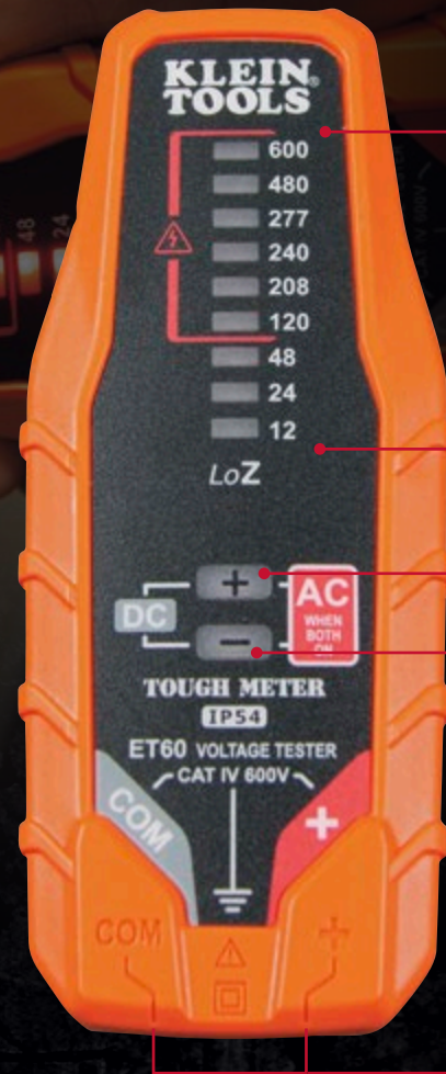
Voltage Indicator LEDs