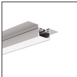
GIZA-LL-UST A02724N Ref. arch C2724