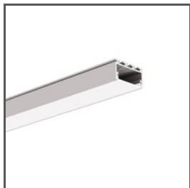
GIZA-LL A00758 Ref. arch C0758