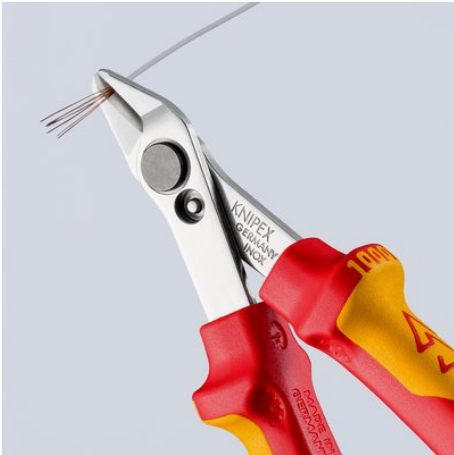
!Für Einsätze unter Spannung bis 1000 V!