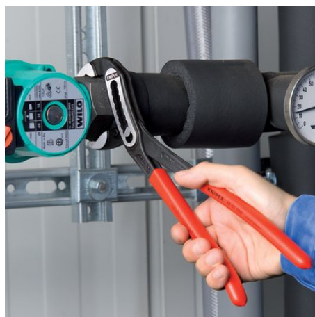
Self-locking on pipes and nuts: no slipping on the workpiece; the complete actuating force can be used to turn the workpieces; not having to squeeze the pliers handles reduces the required effort