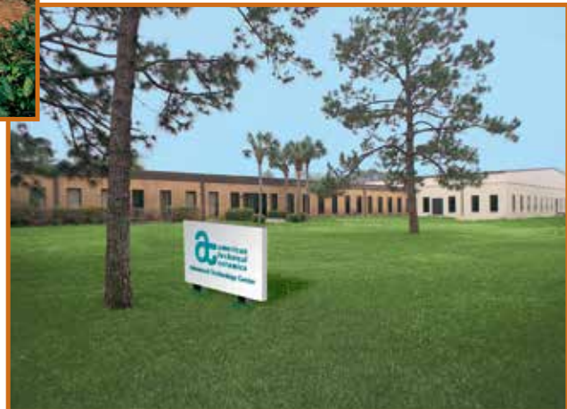
▲ ATC's Jacksonville Facility occupies approximately 100,000 sq. ft.