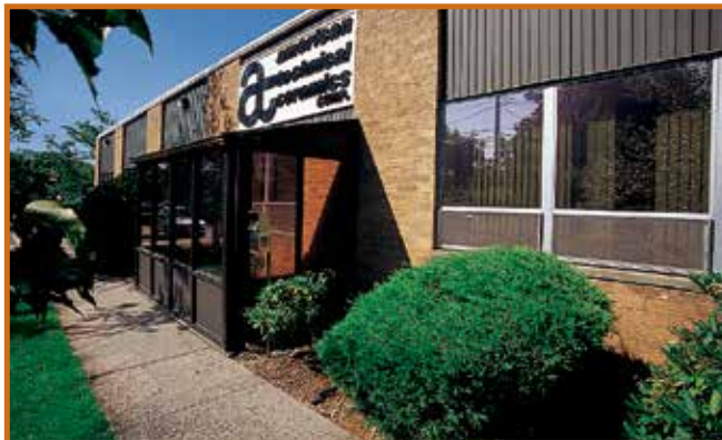
▲ ATC's New York Facility occupies approximately 90,000 sq. ft.