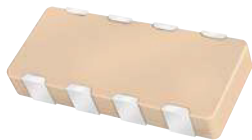
0612 - 4 Element

As the market leader in the development and manufacture of capacitor arrays AVX is pleased to offer a range of AEC-Q200 qualified arrays to compliment our product offering to the Automotive industry. Both the AVX 0612 and 0508 4-element capacitor array styles are qualified to the AEC-Q200 automotive specifications.