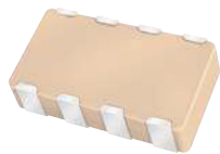
0508 - 4 Element