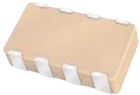
0508 - 4 Element