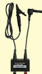
8302 Adapter for recorder (Output 1mV/1μA)