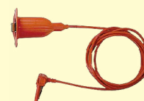
7168A Line probe with alligator clip(3m)