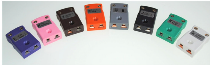
'IEC Colour Coded'