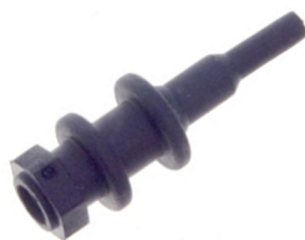
Rubber grommet for miniature connectors