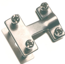
Cable clamp for miniature connectors