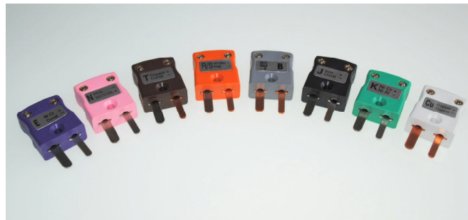
'Thermocouple connector with flat pins'