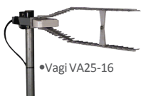
• Vagi VA25-16

The Vagi/Yagi Series are rugged, easy-to-install, high-gain directional antennas used in a wide variety of wireless systems where low cost, good performance and low wind loading are important factors. They include either a VPOL or HPOL configuration, along with a 1.5 VSWR as well. These antennas can be pole mounted in outdoor environments.