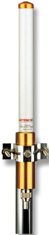
FG8240 (Shown with optional FM2SP mounting kit)