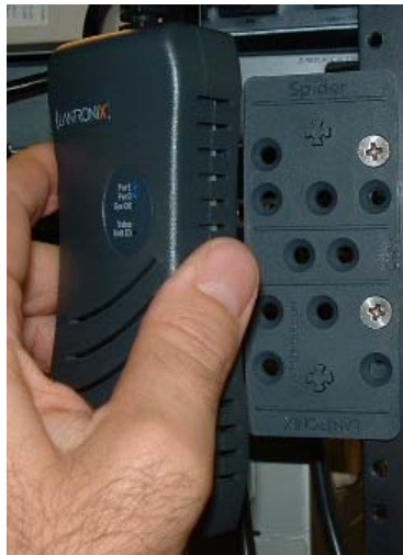
2. Attach the Spider to the bracket's mounting posts