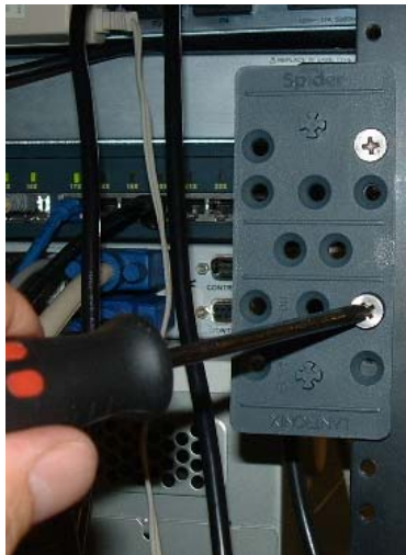
1. Mount the bracket with a Phillips-head screwdriver

There are 3 easy steps to install the mounting bracket and Spider into a server rack: