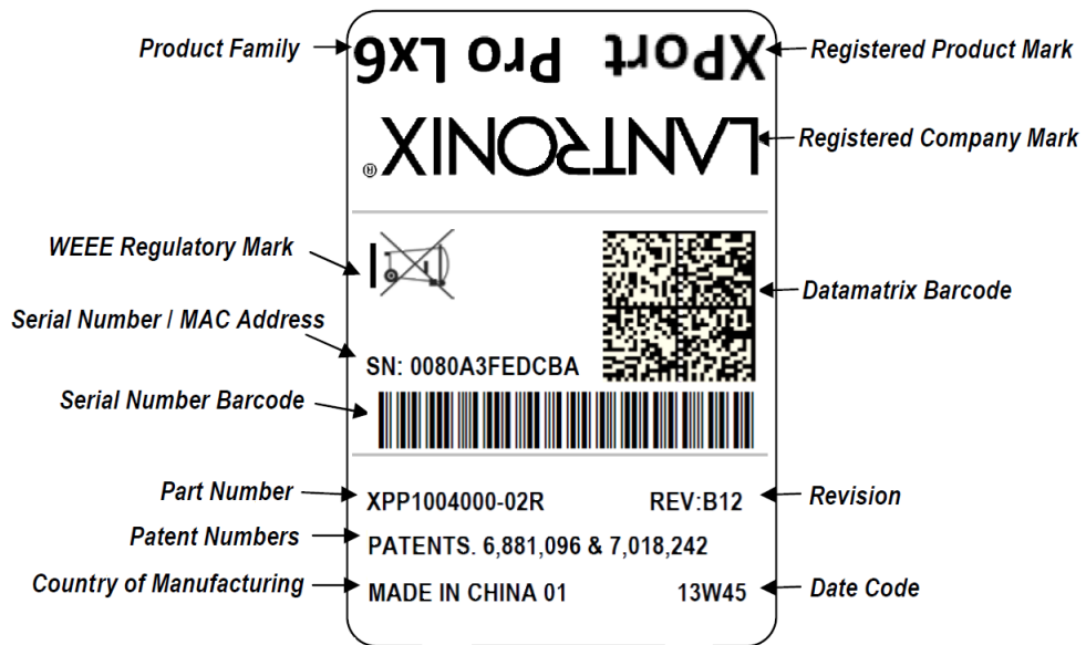
Figure 2-1 XPort Pro Lx6 Product Label