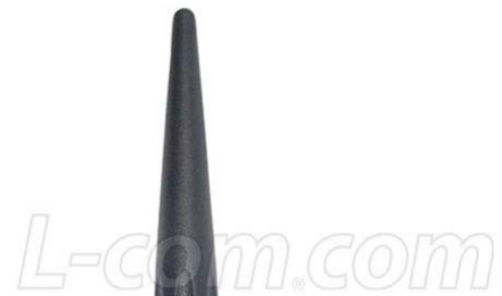
(HG2403RD-SM Model Shown)