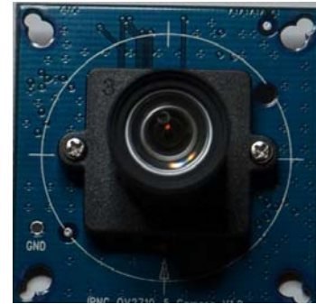
LI-CAM-OV2715 Camera Module

Leopard Imaging provides the Time-to-Market camera development kit with seamless interface to TI IPCamera with a standard 36-pin ZIP connector interface as well as Leopardboard 365 or Leopardboard 368 through an adapter board LI-VCAMADAPTER. LI-CAM-OV2715 is a high-resolution digital camera Module. It incorporates an OmniVision 1/2.7-inch CMOS digital image sensor OV2715, with an active imaging pixel array of 1920H x 1080V. The LI-IPCAM-OV2715 Camera Module produces extraordinarily clear, sharp digital pictures, and it is capable of capturing both continuous video and single frame, which makes it the perfect choice for surveillance industry, machine vision industry.