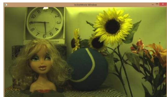
Camera Tool view mode