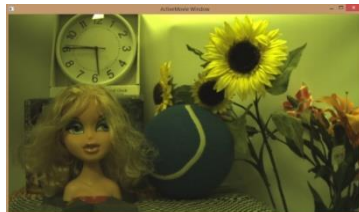
Camera Tool view mode