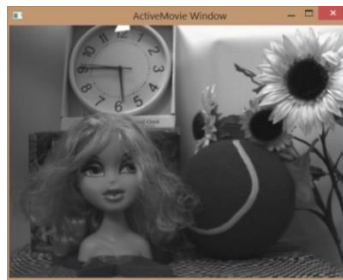
Camera Tool view mode