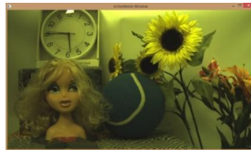
Camera Tool view mode