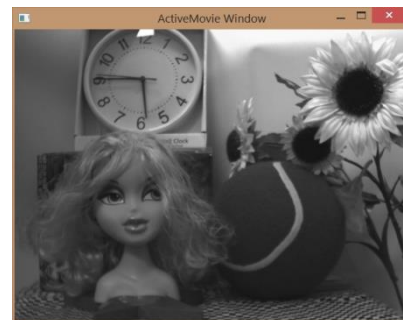
Camera Tool view mode