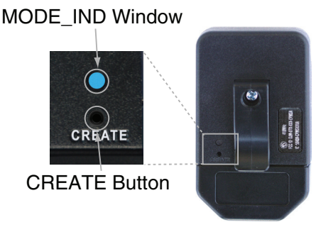
Figure 5: CREATE Button Access

The MS Compact Handheld Transmitter allows the selection of one of 16,777,216 (2<sup>24</sup>) unique addresses. All transmitters are supplied set to a unique address to avoid contention with other units; however, the address can be changed. This is accomplished by using a paper clip or probe to press the CREATE button on the board through the hole in the back of the