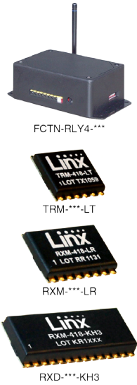
Figure 9: Linx Receivers

Application Note AN-00300 discusses in detail how to set the addresses on all of the units. Data guides for all of the receivers and the DS Series decoder can be found on the Linx website, www.linxtechnologies.com .