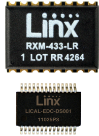
Figure 9: Linx Receivers

Application Note AN-00300 discusses in detail how to set the addresses on all of the units. Data guides for all of the receivers and the DS Series decoder can be found on the Linx website, www.linxtechnologies.com .