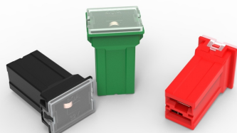
PAL Fuses - 2938 Series