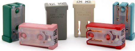
MCASE+™ Cartridge Fuses