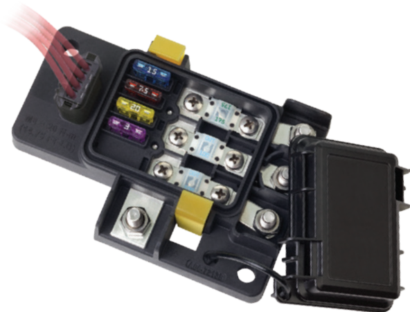
Fuses sold separately

350A • 7 Fused Circuits • Integrated Sealed Low-Amp Plug Outputs