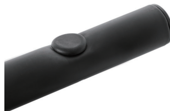
Non-skid rubber pads