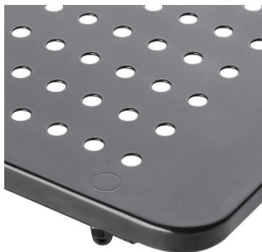
Increase air circulation