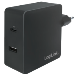
PA0213 USB-C 65W PD Port