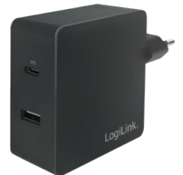
PA0213 USB-C 65W PD Port