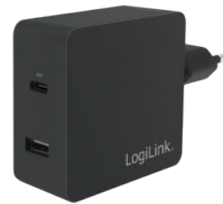
PA0212 USB-C 45W PD Port

Charge your power-hungry devices with one 45W or 65W USB-C port and one 2.1A fast charging USB-A port.