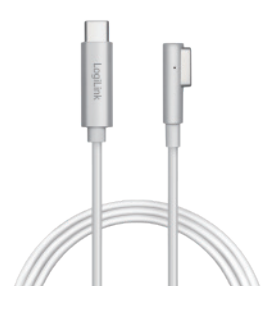
PA0225 USB-C<sup>™</sup>to Apple MagSafe® Charging Cable