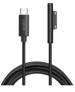
PA0224 USB-C™to Microsoft ®Surface Charging Cable