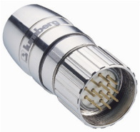
0976 PMC 201