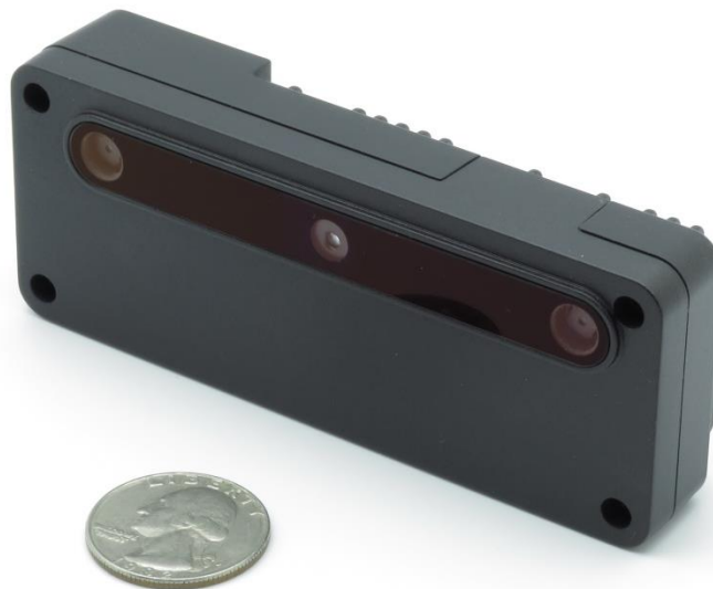
Figure 1 – OAK-D IoT-75