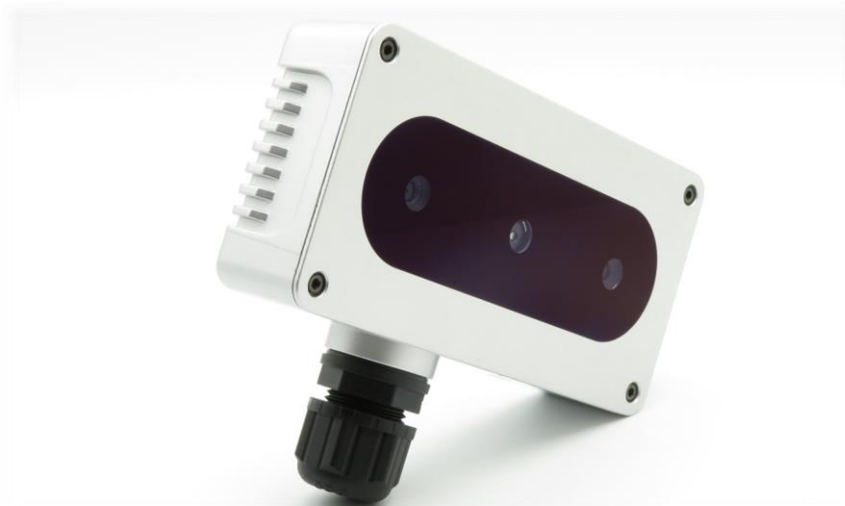
Figure 1 – OAK-D PoE