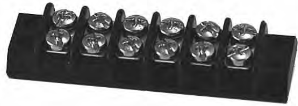
106 / 670A GP 06