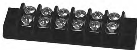
106 / 670A GP 06