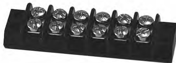
106 / 670A GP 06