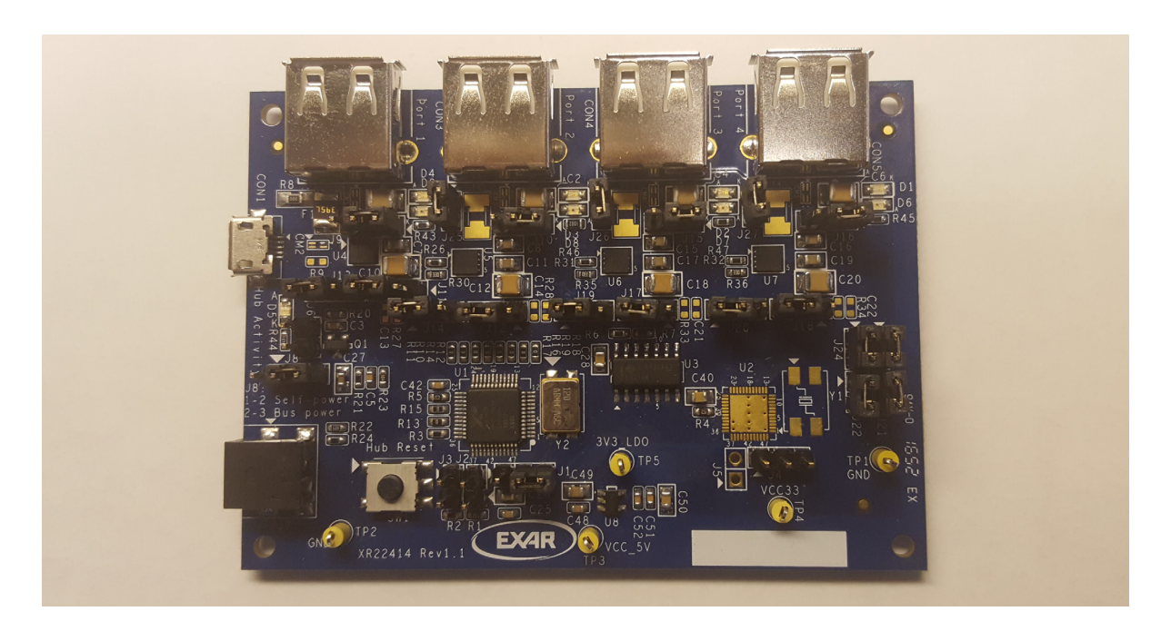
Figure 2: XR22414 PCB