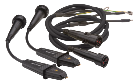
+ DH4-C probe 1.5 m leads