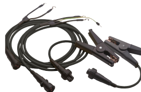
+ KC1 Kelvin clip 3 m leads