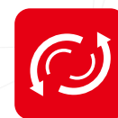
Multiple OS Compatibility