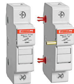
UltraSafe fuse holder with USPTH Pin-Ties