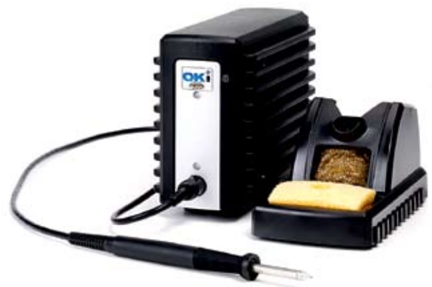
MFR-1160 (MFR-1100 Single Output Soldering & Rework System with MFR-H6-SSC hand-piece)