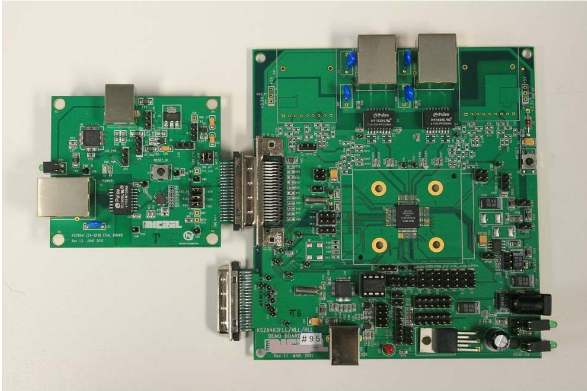
Figure 2. KSZ8081RNA-EVAL interfacing with KSZ8463RLI Evaluation Board

The KSZ8081RNA-EVAL / KSZ8081RND-EVAL accesses RMII data from the MII connector J4. This connector is also optionally used for MDC/MDIO management bus access and for 5V power to the evaluation board. Figure 2 shows the KSZ8081RNA-EVAL / KSZ8081RND-EVAL connected to the Micrel KSZ8463RLI Evaluation Board through connector J4.