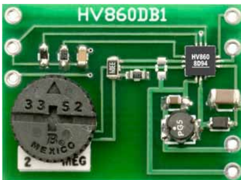
Actual Dimensions: 20mm x 25mm