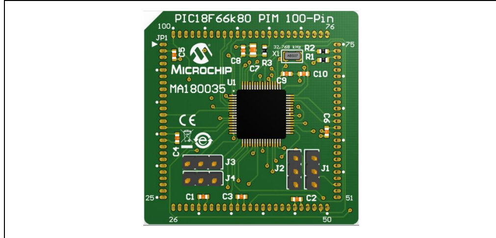
FIGURE 3-1: 3D VIEW OF PIC18F66K80 100-PIN PIM