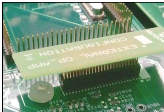
FIGURE 2: EXTERNAL OP AMP CONFIGURATION BOARD

Table 1 provides information on the hardware versions of the motor control boards that are compatible with this PIM. Refer to the user's guide of the specific motor control board to find information related to hardware version identification.