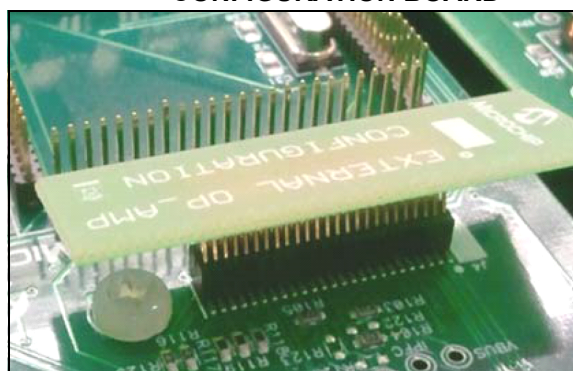
FIGURE 2: EXTERNAL OP AMP CONFIGURATION BOARD

Table 1 provides information on the hardware versions of the motor control boards that are compatible with this PIM. Refer to the specific motor control board user's guide for the hardware version identification information.