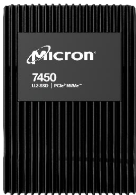
U.3: 7mm and 15mm

Designed as a mainstream solution, the 7450 SSD balances performance and density. Our offering includes a PCIe Gen4, M.2, 22 x 80mm with power-loss protection 4 and a 7.68TB E1.S that delivers industry-leading capacity. 5